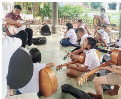
Thai students from the public schools are thrilled to have an opportunity to learn how to play guitars as they also learn about Jesus from their teachers and the songs.