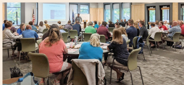
Michigan District principals prepare for their new school year, including Garuna as a part of their planning! They want to help their students make an impact in Cambodia.