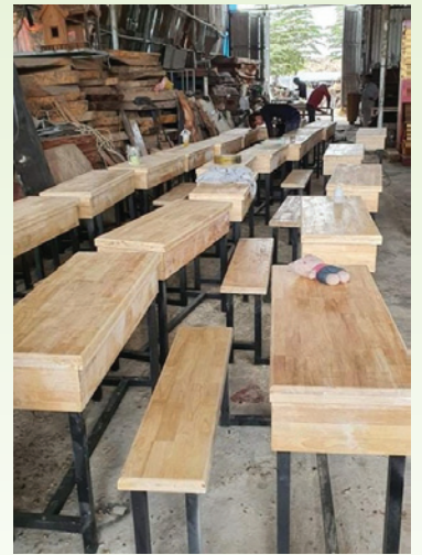
The desks purchased by the Wisconsin students were crafted by Cambodian carpenters in Phnom Penh. "Buying local" is Garuna's goal whenever possible!