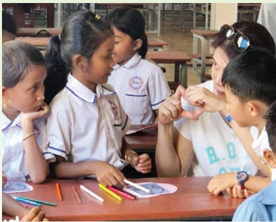
Concordia Shanghai teachers, students and families love to visit the Garuna Christian Schools to help share the love of Jesus with the Garuna Kids in Cambodia.